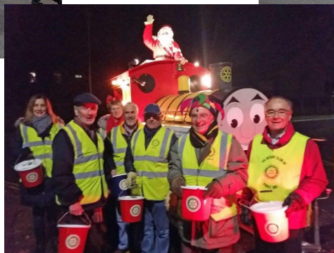
Out with the float on